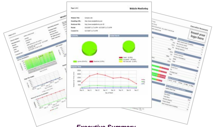
Web-based Central Dashboard