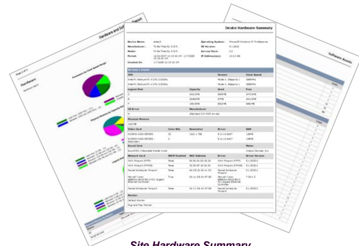
Site Hardware Summary Device Attributes Software Asset Inventory