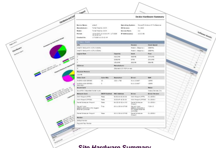
Device Management – Hardware/Software