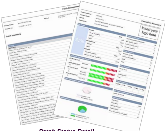
Patch Status Detail Server Health Report