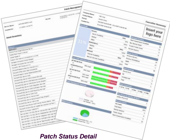
Patch Status Detail Server Health Report