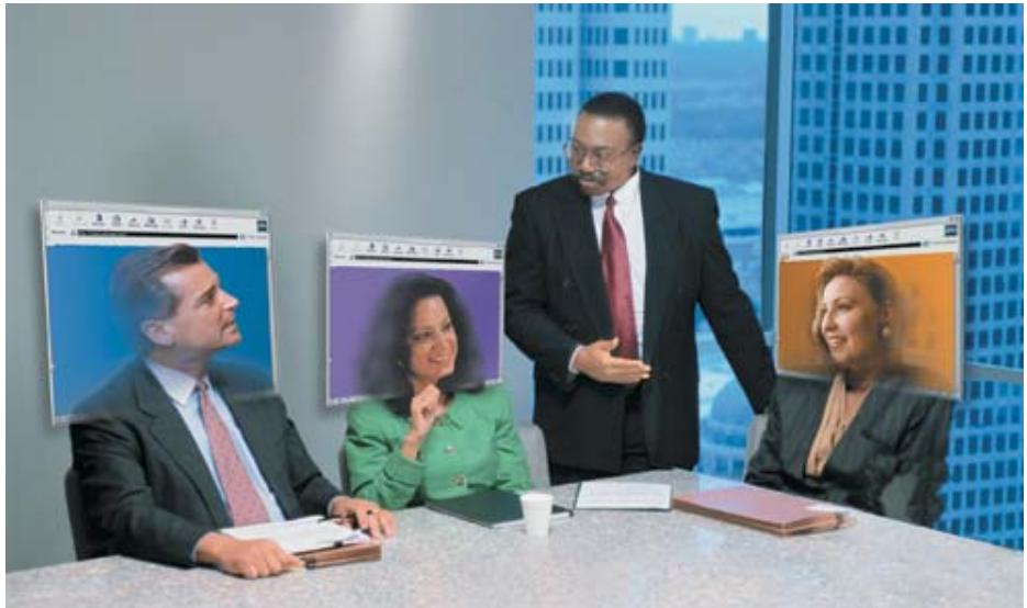
IPx Connect Provides Interactive Online Meetings